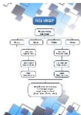
Figure 3 Concept Map

The results of the LKPD cover design contain the identity of the LKPD, namely the title of the LKPD “Mathematics Learner Worksheet; Flat-Sided Spaces Based on Jambi Culture; SMP / MTs ClassVIII”. The author also includes the author's identity and symbols of the author's institution, namely the University of Jambi, and images of related Jambi cultures.