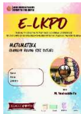
Figure 2 E-LKPD Cover

At the Design Stage, researchers must design E-LKPDs with a problem-based learning approach based on Jambi culture to improve students' mathematical communication skills on flat-sided space-building material. The design or storyboard in making a media is important to do so that the media made is in accordance with what is needed. At this stage, researchers design products in the form of E-LKPD with a problem-based learning approach based on Jambi culture. The initial stages carried out to design E-LKPD are collecting information related to material from various sources, such as books, the internet, or other learning media. The results of the E-LKPD design can be seen in the following figure: