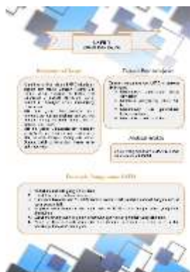
Figure 5 E-LKPD Instructions

In this section of the page, the description of the student worksheet with the PBL approach and based on Jambi culture.