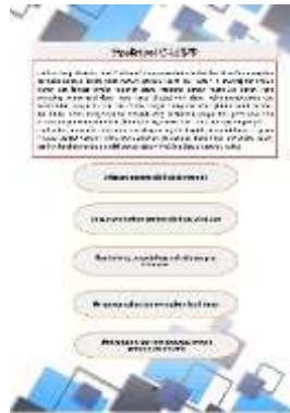
Figure 4 Description of E-LKPD

On the concept map page or the sequence of material that students will learn during the learning process on flat-sided space building material. concept maps make it easier for students to know the overview in learning flat-sided space building material in general.