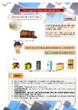
Figure 6 E-LKPD Materials and Activities

This section of the page contains learning instructions for teachers and students in using student worksheets with a PBL approach based on Jambi culture.