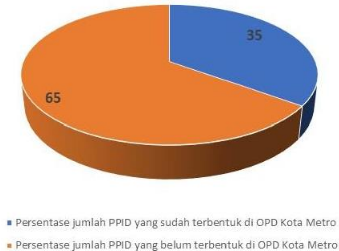
Diagram 3. Respondents' opinions on the formation of PPID in OPD Metro

in their agency. The following is the percentage of OPDs within the Metro City government that have formed PPID.