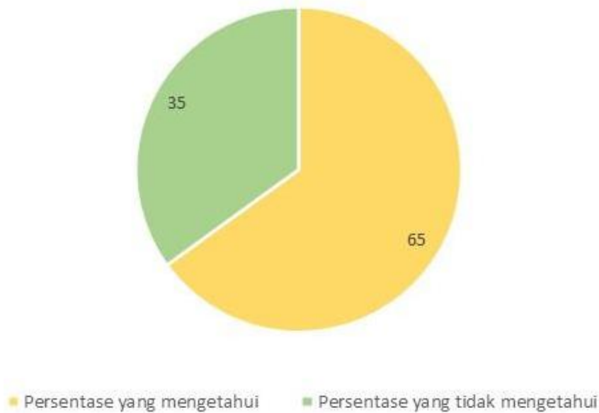
Diagram1. Respondent's Opinion on Knowledge of Law No. 14 of 2008